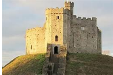
A Norman Castle