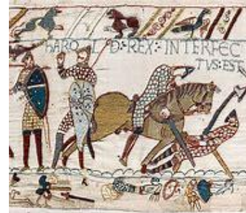
Part of the Bayeux Tapestry